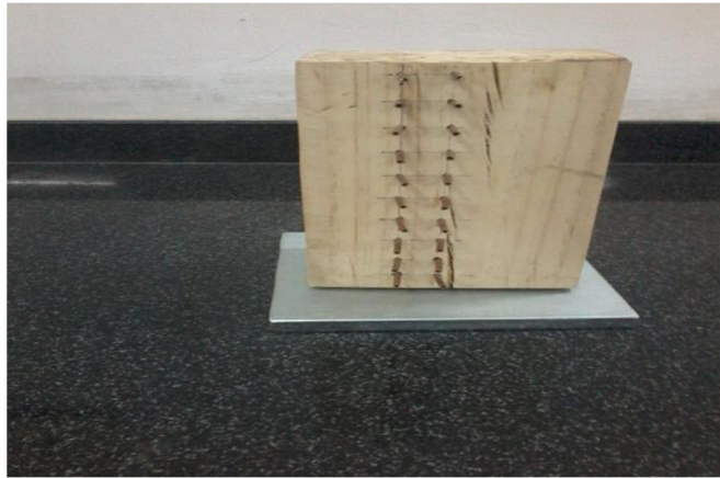
Figure 3 : Building Model with pressure tappings

A 50 storey building H=150 m tall prototype building has a rectangular cross section with constant dimension 45.72\text{m} \times 30.48 m over the building height.